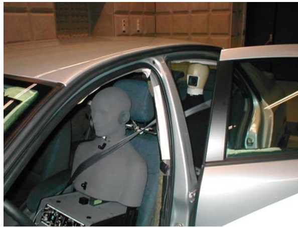
Figure 2. Head and torso simulators used.

The measurement system, fully explained in [3], is based on a pair of HATS (head and torso simulators): one is employed as an artificial mouth, the second as a binaural microphone. The “listener” was in the driver position while the “speaker” was in the real seat exactly behind the driver.